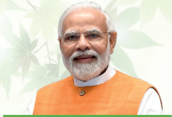
Shri Narendra Modi Hon'ble Prime Minister